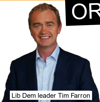
Lib Dem leader Tim Farron