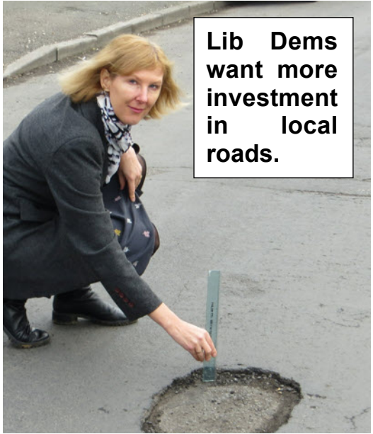
Lib Dems want more investment in local roads.

The Council paid out a total of £459,552 in compensation in respect of 265 successful claims.