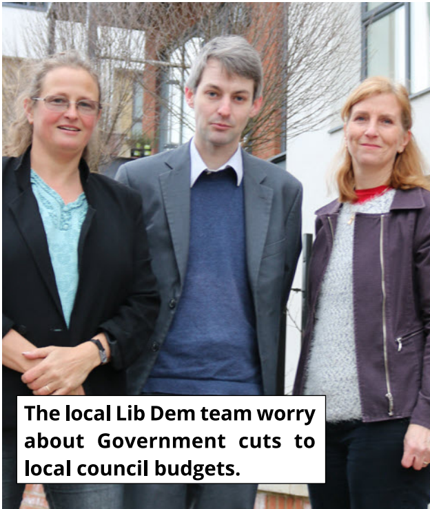
The local Lib Dem team worry about Government cuts to local council budgets.

Local Lib Dems have criticised Woking's Conservative MP after he voted in favour of the Local Government Finance Settlement which includes significant funding cuts for Surrey and Woking Councils.