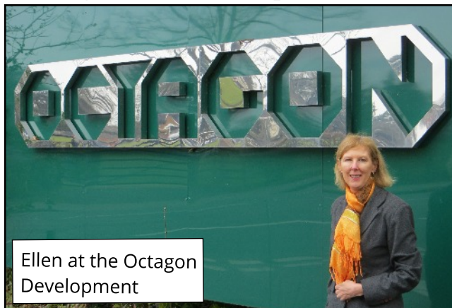
Ellen at the Octagon Development

New proposals by Octagon at the Broadoaks development include more affordable homes, a purpose built retirement block and an 80 bed care home, which will create around 80- 90 new jobs.