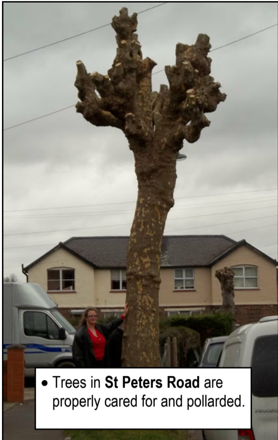
• Trees in St Peters Road are properly cared for and pollarded.